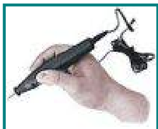
Figure 26. Hand engraving tool for metal identification tags.