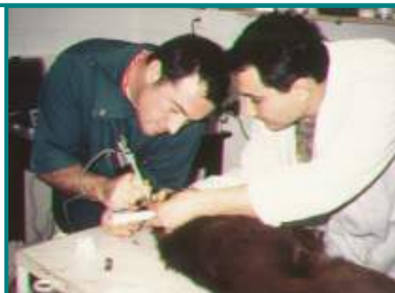
Figure 3. Whilst still unconscious following a neutering operation, a dog's ear is tattooed using an electric tattooing device.

An electricity supply is required for this method.