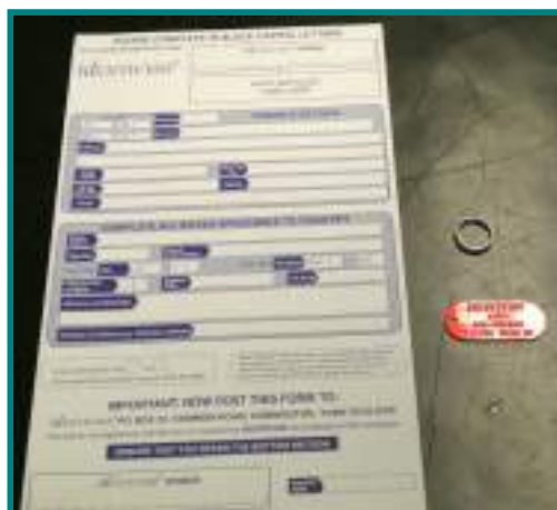
Figure 19. Identichip® registration form and tag.

Many organisations are already operating substantial companion animal databases. These include ICAR member organisations and animal protection organisations, as well as governments and municipalities. According to ISO 11784, ideally every country should maintain databases of information about all issued codes and the associated animals.