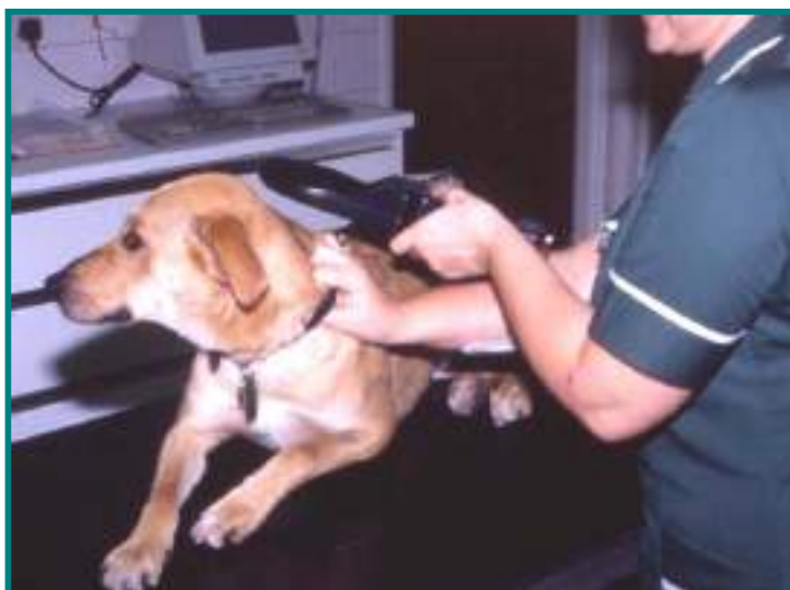
Figure 18. Scanning a dog for a microchip. It is important to scan the whole animal.