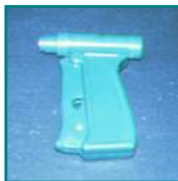
Figure 16. Microchip implanting gun.

The microchip should be fitted according to the manufacturer’s instructions (manufacturers should provide an Implantation Manual to each implanting agent), but the following are guidelines: