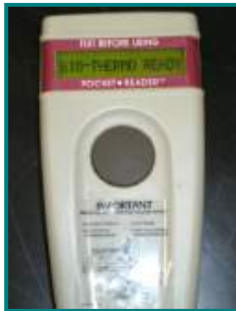
Figure 14. Portable microchip scanner.

Scanners generate a low frequency radio band that is intercepted by the microchip, which uses the energy from this band to power itself and transmit a return signal to the scanner. The scanner decodes the signal and displays the microchip's identification code on a liquid-crystal display window. With some scanners, the code can be relayed via computer interface to a database to instantly yield information about the microchipped animal (see Figure 14).