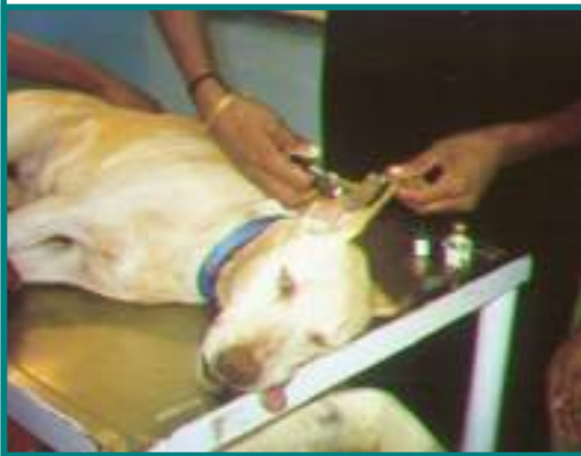
Figure 5. The ear of an anaesthetised dog is tattooed with forceps.