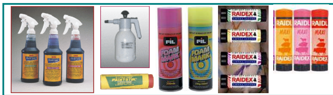
Figure 30. Various paint/dye animal marking products, from left: spray dye, dye pressure sprayer (for concentrate), non-toxic paint stick, coloured foam marker, long-lasting animal marking sticks, high-visibility spray in fluorescent colours.