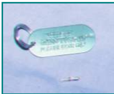
Figure 10. Identichip® microchip and accompanying tag.

The obvious disadvantage is that microchips do not provide visible identification; hence they need to be coupled with a visible method, preferably one that indicates the presence of a microchip (most microchip suppliers provide an accompanying tag to display on the animal's collar, as in Figure 10).