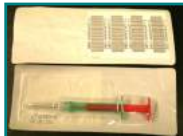
Figure 12. PPS unit including disposable syringe.

Only microchips complying with ISO standards 11784 and 11785 should be used to identify companion animals (see Standardisation). Every microchip must be supplied in a 'pre-packed sterile' (PPS) unit (see Figure 11). The PPS unit should contain the microchip and needle, a sterilisation indicator, an expiry date and at least three self-adhesive bar codes containing the microchip's code (one each for the owner, the implanter's records, and the database). In some units, the microchip will be contained within a needle already attached to a disposable syringe (as in Figure 12). In others, the microchip and needle will have to be placed in a re-usable 'gun' (see Figure 16).