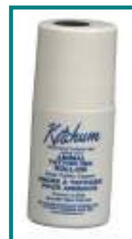
Figure 9. Ketchum® roll-on tattoo ink.