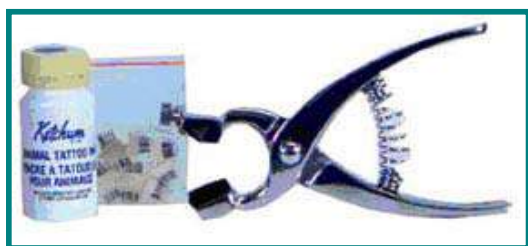
Figure 7. Ketchum® tattoo forceps, set of characters (digits 0 – 9 and A – Z), and tattoo paste.