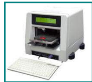
Figure 27. VetScribe™ automatic rabies tag engraver.