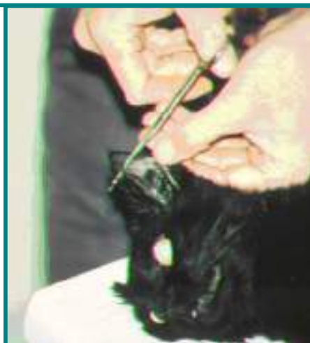
Figure 22. Whilst still unconscious following a neutering operation, the tip of a cat's left ear is removed.

Cut along the line using sterile surgical scissors or scalpel blade (see Figure 22). Cautery can also be used although some report that this produces a ragged effect on healing. To create a distinctive silhouette it is important that the cut is as straight as possible and the tip looks artificial.