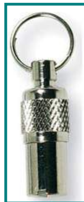
Figure 28. Identification 'barrel'.