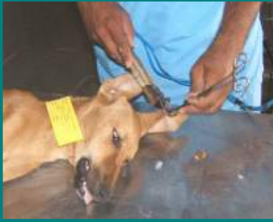
Figure 23. Ear notching of anaesthetised dog.

Ear notches can be cut using ear notch pliers, which should be kept sharp and disinfected between animals. Alternatively, a thermocautery device can be used to cut a semicircular notch out of the leading edge of the pinna (Figure 23).