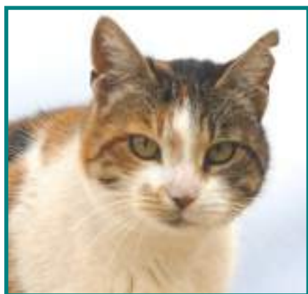
Figure 21. Ear-notched cat.

This identification method should be used as part of a controlled programme in which cats are returned to a managed site where they will be cared for. Feral, unsocialised or ownerless stray cats that have undergone treatment as part of this programme should always be ear tipped before being returned to the original site or relocated to a new colony. For owned cats, owner consent must be obtained before ear tipping occurs. If a cat has definite signs of a previous neutering operation, it should be ear tipped, but if there is any doubt then the cat should be neutered and ear tipped. It is hoped that ear tipping will become a universal indicator of a neutered cat that is being cared for as part of a management programme. In the UK, for example, an ear tip is officially recognised in this way, and animal control officers know when they encounter an ear tipped cat that it is part of a managed colony.