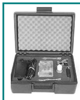
Figure 8. Jorgenson® complete small animal electric tattooing kit.