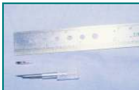
Figure 13. Microchip and implanting needle.

Microchips 12mm in length or less have been shown to be least prone to migration or breaking in independent trials 7 . The needle gauge and needle outer diameter are also important to consider. The needle needs to be larger than a conventional needle as it must house the microchip, but should be as thin and sharp as possible to minimise discomfort and the risk of haematoma upon insertion (see Figure 13). The supplier should offer to repurchase unused PPS units (to ensure their safe disposal).