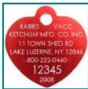
Figure 25. 2008 'Red heart' rabies vaccination tag, provided by Ketchum Mfg. Co.®.

A collar and tag is the most common identification method for owned dogs and cats. In many countries it is a legal requirement that companion animals wear collars displaying key information when in public. The owner's name and contact details, or those of a pet registry, and sometimes medical information, are inscribed either on a tag attached to the collar (as in Figure 24), or on the collar itself. Owners must ensure the information displayed by collars is accurate and up-to-date. Some pet registries will engrave a unique code on a tag to be issued when animals are registered, often to accompany a microchip.