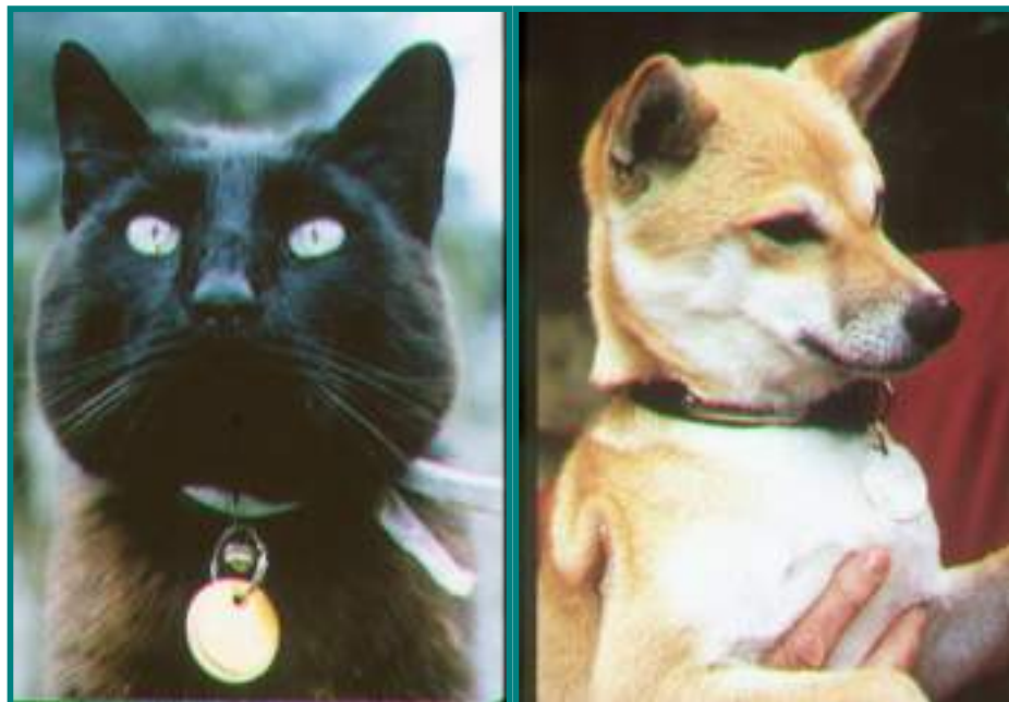
Figure 24. Dog and cat wearing collars with identification tags.

A collar and tag is the most common identification method for owned dogs and cats. In many countries it is a legal requirement that companion animals wear collars displaying key information when in public. The owner's name and contact details, or those of a pet registry, and sometimes medical information, are inscribed either on a tag attached to the collar (as in Figure 24), or on the collar itself. Owners must ensure the information displayed by collars is accurate and up-to-date. Some pet registries will engrave a unique code on a tag to be issued when animals are registered, often to accompany a microchip.