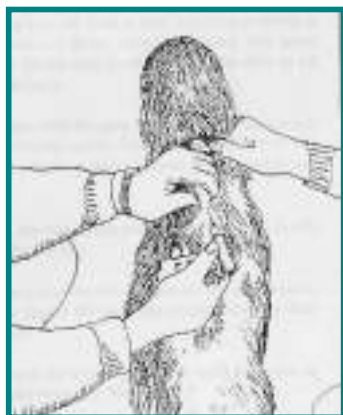
Figure 17. Implanting a microchip- one person restrains and comforts the animal, whilst another implants the microchip.