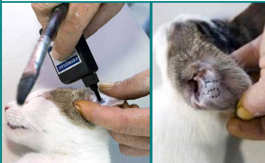
Figure 6. Ink is applied to the ear of an anaesthetised cat that has been notched with tattoo forceps.