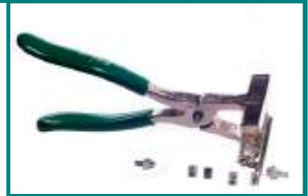
Figure 4. Ritchey® ear tattoo forceps.

The exact procedure will depend on the particular model of forceps used – instructions supplied by the manufacturer should be followed carefully, but these are general guidelines: