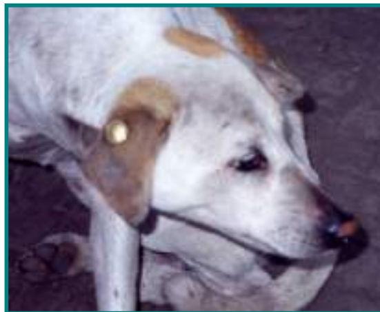
Figure 29. Dog with metal ear tag.

Ear tagging is not a recommended method for the identification of companion animals because tags can be removed, fall off or become snagged, and there is a high risk of injury and infection.