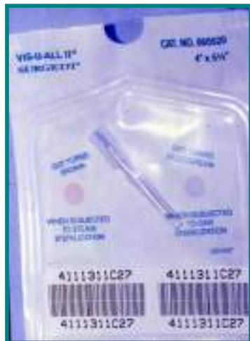
Figure 11. Individual pre-sterilised microchip pack (PPS).

A microchip is an integrated circuit contained within a very small transponder, ranging in size from 12 to 28mm long and 2 to 3.5mm in diameter. The device is encased in biocompatible glass, so it can be inserted into living tissue without causing injury or adverse reaction, and can fit inside a compatible hypodermic syringe. The memory circuit of each microchip is programmed with a unique 15 digit alphanumeric code. The microchip itself is inactive with no internal power source – it is energised by the radio signal transmitted by the scanner.