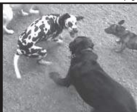
The entrance to a dog park is where a lot of problems occur. Too many dogs converge on the newcomer, who sometimes resorts to aggression when faced with the inappropriate greeting styles of the dogs at the gate.