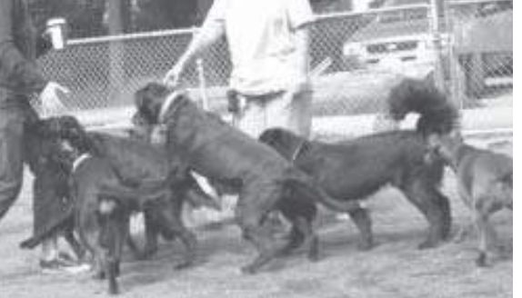
Although many dog owners think all play is in good fun at dog parks, some dogs learn bullying play styles that can lead to other problems.