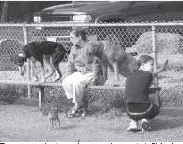
These owners inadvertently communicate to their Chihuahua that he is on his own when he is at the dog park.

need to meet with all other dogs. It often takes some time for one dog to feel comfortable with another; and they need that time to decide how they should react. As we know, time is not always available in a dog park situation. Thus, even friendly dogs that feel uncomfortable can give people the impression that they are "aggressive," especially when they meet a dog for the first time. If an overly exuberant